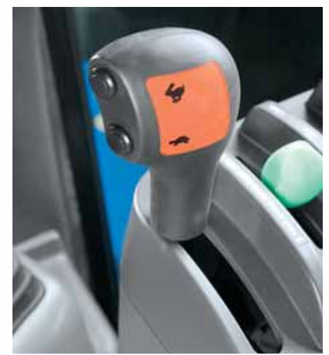
The Hi-Low shift on the 24x6 synchronized transmission is integral with the throttle lever for easy operation.

Road. In Auto Field Operation, AutoShift automatically downshifts as needed to maintain engine speed and torque and subsequently upshifts within the range as load decreases. In Auto Road Operation, it automatically selects the proper gears based